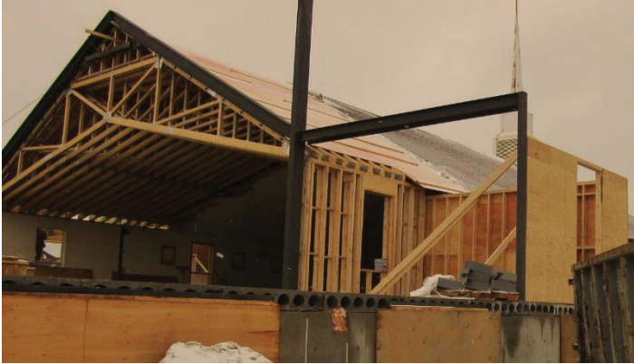
Construction of outer and inner walls